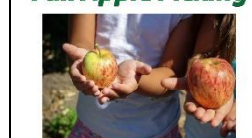
Care of Creation rcdony.org/about/creation/ourdata-st.html