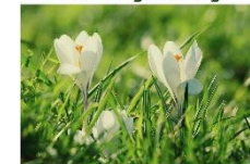
Care of Creation rcdony.org/aboutdiocese/laudato-si.html

ENVIRONMENTAL STEWARDSHIP: Creation Care Tips: "If someone has not learned to stop and admire something beautiful, we should not be surprised if he or she treats everything as an object to be used and abused without scruples." Laudato Si' (# 215)