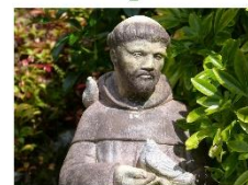
Care of Creation rcdony.org/about/diocesa/laudato-sl.html