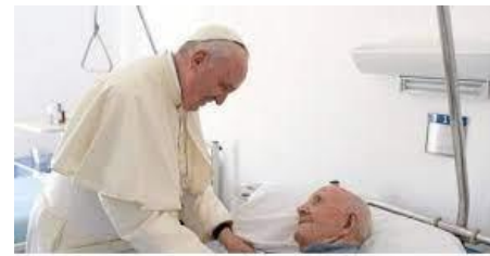
World Day of the Sick