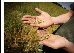
Care of Creation rcondony.org/aboutdiocese/laudato-si.html

O God, who through the fruitful virginity of Blessed Mary bestowed on the human race the grace of eternal salvation, grant, we pray, that we may experience the intercession of her, through whom we were found worthy to receive the author of life, our Lord Jesus Christ, your Son.