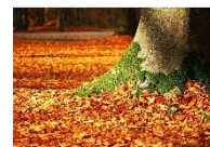
Care of Creation

ALL SAINT'S DAY - ALL HALLOWS DAY: According to Christian origins and historic customs Halloween is thought to have roots in Christian beliefs and practices. The English word 'Halloween' comes from "All Hallows' Eve", being the evening before the Christian holy days of All Hallows' Day (All Saints' Day) on 1 November and All Souls' Day on 2 November.