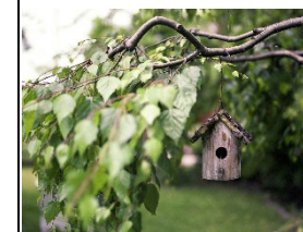
Care of Creation rdony.org/about/locesse/laudato-sl.html